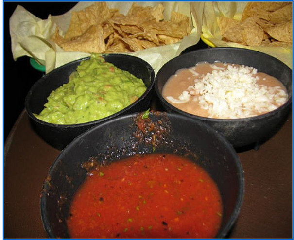
The trifecta of yumminess: Guacamole, salsa and beans with chips.

We got there late, so we missed out on the ceviche, but we were able to get their beans, salsa and guacamole with chips. Had these items been placed in my bowls I could have sworn they were homemade by yours truly. They are just simple, delicious and very satisfying.