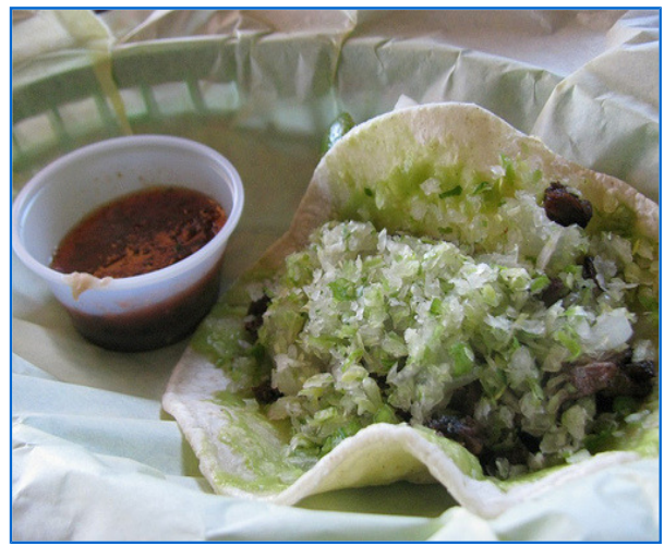
America's carne asada Vampiro

I must also report that America's chips are wonderful. They are thick enough to take on the beans and guacamole, but delicate enough to provide that perfect crunch I favor in tortilla chips.